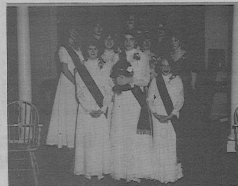
Newly installed officers of Lilac triangle #121.