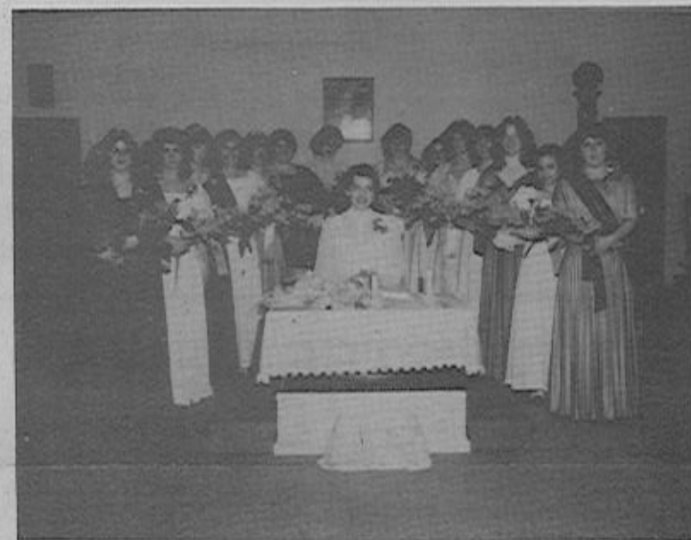
Beloved Queen and her honor guard.