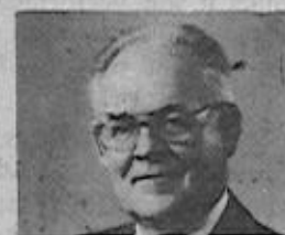
R. Kenneth Crawford Funeral Directors